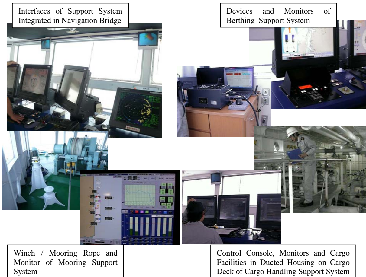
Fig. 5.1 Images of Labor-Saving Support System Equipped on Shige-maru

Lastly, we show the images of support systems onboard the Shige-maru. Interfaces are integrated on the navigation bridge. A speech interface is adopted to be a human friendly interface, that enables appropriate cooperation between a human operator and support functions.