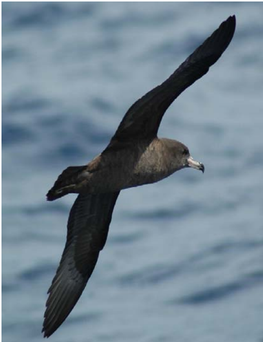
Figure 1. Flesh-footed shearwater

Despite the well-documented potential significance of such interactions, there have been few studies that