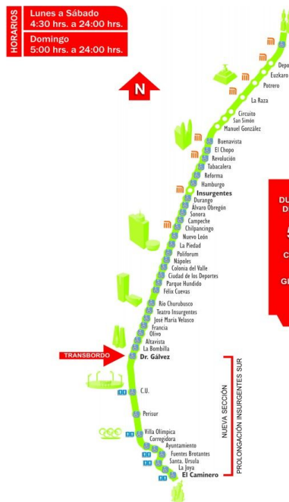
Figure 1. Metro-bus line

Metro-bus is a bus rapid transit (BRT) system in Mexico City, Mexico. The first line, line 1, covers a distance of 20 kilometers, running in a dedicated bus-lane along Avenida de los Insurgentes, see fig 1. This line starts at Metro Indios Verdes. From there it runs south, through Cuauhtemoc and Benito Juarez, before terminating in the San Angel district of Alvaro Obregon borough, providing a total of 36 stations.