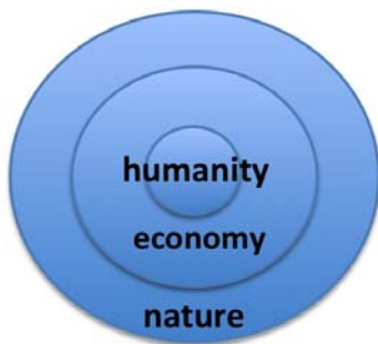
Figure 2. A buffer model of the global system; Giannetti, 1993

Based on the co-evolutionary paradigm (e.g. Norgaard, 1997), it is possible to model the interactions within the global “humanity–global economy–nature” system. The important point is that all three should be modelled and analysed simultaneously in terms of their global interactions. In other words, a model: (1) should not be representing only one of the components (e.g. the economy) against the other two; and (2) should allow a study of the conflict and risk factors together with the resulting changes of transformation and co-adaptation that shape the co-evolutionary process. Hence, sustainable development is not only a macroeconomic concept, it is not only nature conservation either. It can be social advancement but again cannot happen in isolation from nature and the economy. Sustainable development is a development that synchronises and harmonises economic, social and ecological processes.