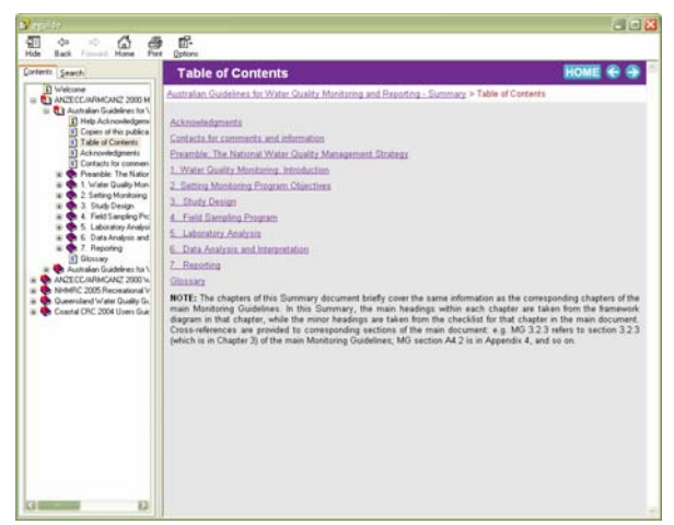
Figure 2. eGuide, an electronic documents

These documents have been compiled into a standard "HTML" version of Windows help systems (Figure 2) and able to install in any personal computer for easy and quick access to information. Users can select the document that they would like to manually browse, or select the 'search' tab to search all the guides for some key words. The searched items can be viewed, copied to another document or printed out for later references. The beta version of this tool has been released and available at (www.wqonline.info).