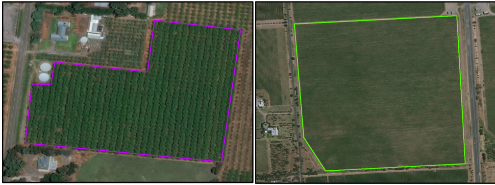
Figure 1. Aerial images of the almond (left) and wine grapes (right) fields used in this study

In the tabulated K_c methodology, soil hydraulic characteristics are taken into account. These values are taken from Pitt et al. (2015), which specifies the almond field had a RAW of 20-30 mm with a rooting depth of 0.6 m. The vineyard was reported with a RAW of between 35-44 mm and a rooting depth of 0.6-0.8 m. Multiplying these to find a maximum and minimum value, gave irrigation depths of 12-18 mm and 20-35 mm for the almond and wine grapes respectively. These values were used when calculating irrigation applications to fill soil water deficits. As a range was provided, the maximum and minimum values were both included in results as the shallow and deep irrigation depths.