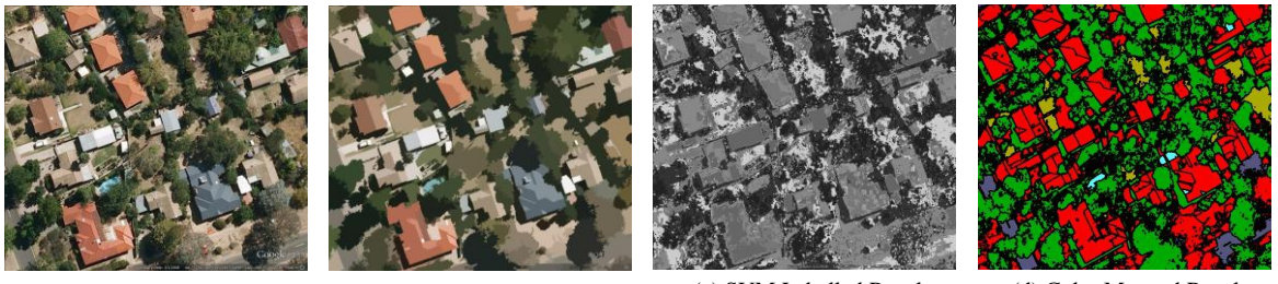
(a) Original Imagery

The trained SVM model was used as an input parameter in OTB application of 'ImageSVMClassifier' to perform the SVM classification using the 'decision rule' which was learned from the training dataset. The results of an SVM classification is a labeled raster file. The SVM labelled results and the color mapped results are shown in (c) and (d) of Figure 2. In the color mapped results, red represents roofs, green represents vegetation, yellow represents land, and dark blue represents roads.