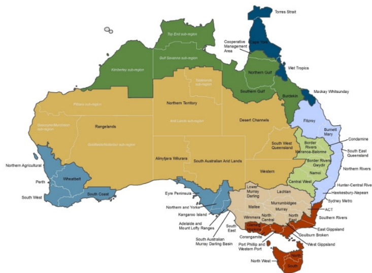
Figure 1. Australia’s 56 NRM regions divided into eight clusters for delivery of Stream 2 projects.

Our paper focuses on four geographically distinct NRM regions grouped in the WTC, shown in Figure 2 in dark blue. These are the Mackay-Whitsunday, Wet Tropics, Cape York, and the Torres Strait regions, which are managed by Reef Catchments NRM, Terrain NRM, Cape York NRM, and the Torres Strait Regional Authority respectively.