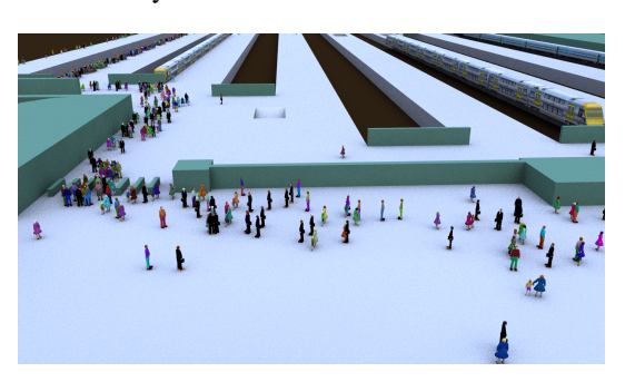
Figure 1. Visualisation of the baseline simulation.

Our conclusions from this work are that overt, intrusive protection schemes appear to be more efficacious than passive or covert means. However, the former present their own problems in both disruption to commuter activities and the creation of new potential targets. In the case of stop and search, this takes the form of unacceptable commuter delays and congestion at the checkpoints. As a result of this, the overall interdiction regime must be adjusted to protect the new target. Doing so without introducing additional targets may prove challenging. It seems that the "best" likely outcome is to redirect the terrorist attack to a softer target.