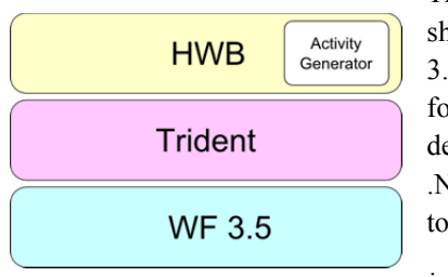
Figure 2. HWB technology stack

While this paper is heavily focused on a specific workflow system and existing tools the methods are