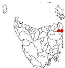
Figure 3. Location of the George catchment, TAS

The study reported here focussed on coastal catchments in Tasmania, Australia. The first step in the modelling process was the selection of a case study area that was suitable for both the scientific and socio-economic research. For the biophysical modelling component, there needed to be a demonstrated impact of catchment management actions on freshwater and estuary water quality and ecology. Another important criterion was the availability of quantitative biophysical data. For the socio-economic research, the presence of environmental assets was important, as potential attributes for the valuation study. Furthermore, natural resource degradation needed to be related to local catchment management and the catchment estuary needed to have economic value.