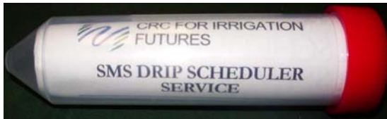
Figure 3. SMS service brochure in measuring vial

By undertaking the processes outlined in the brochure, an irrigator not only initiates the SMS service but also learns about their dripper system application rate variability.