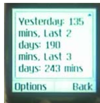
Figure 1. Mobile phone displaying a portion of a typical DSS-generated SMS

An SMS consists of a sender and receiver address (the phone numbers), a sent timestamp, a delivered timestamp and a body of up to 160 ASCII text characters. This limits standard SMS functionality to the sending of a few lines of text. Other forms of SMS are mentioned in section 8, 'Future Work'.