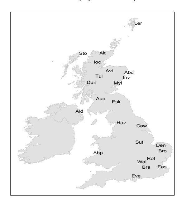
Figure 1. The distribution of sites in the UK

(1998) working in Ontario, Canada, determined a threshold distance for substitution of 390km. Beyond this distance they recommended the use of an interpolation method to provide missing SR data. We investigated the decay in similarity of SR between sites and the change over distance. From this we hoped to determine a baseline of SR similarity decay with distance, against which other forms of data substitution (interpolation, weather generators) can be compared. A practitioner can then determine their own acceptable distance threshold beyond which they will not use observed substitute SR data, but an alternative instead. An investigation was then made to see whether there was a correlation between SR data representation decay with distance and the differences in a range of metrics derived from the CropSyst model output.